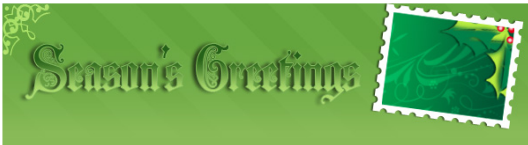
Season's Greetings message on green banner with holiday stamp on right side

As 2018 comes to a close I would like to thank our dedicated staff, our diligent board members, our many generous donors and volunteers - everyone in the the Future In Sight community who work tirelessly to help make a difference in the lives of thousands of individuals we serve throughout New Hampshire who are blind and visually impaired. Infants and their families, children, adults, and seniors benefit from the range of education and rehabilitation services we provide.