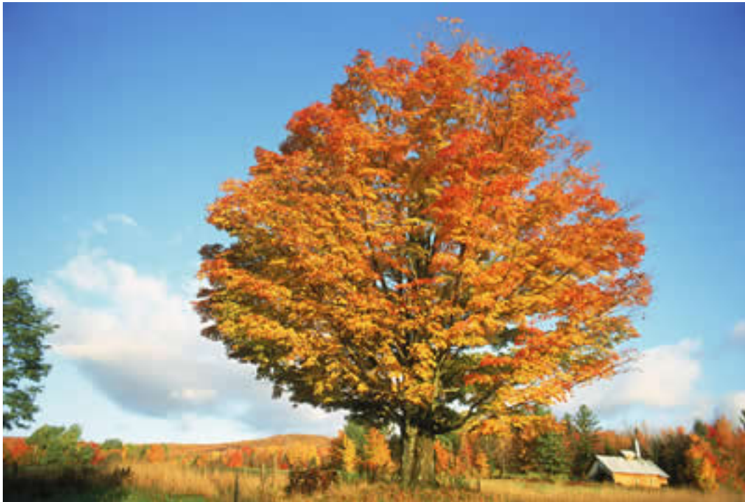
Large maple tree in a field in full foliage colors with blue partly cloudy skies

As the year begins to wind down and the busyness of the holiday season kicks in, I'd like to take this time to reflect on all we're grateful for here at Future In Sight. We are so very fortunate to have a strong network of partners throughout the Granite State that help us build and sustain our programs and services for our family, friends and neighbors that live with profound sight loss. Our network of committed volunteers who give so willingly of their time and talent to assist us in providing transportation, home visits and assistance with special projects throughout the year. And for our clients, who show us each and every day that with hard work and perseverance a life of quality and independence is attainable even with vision loss.