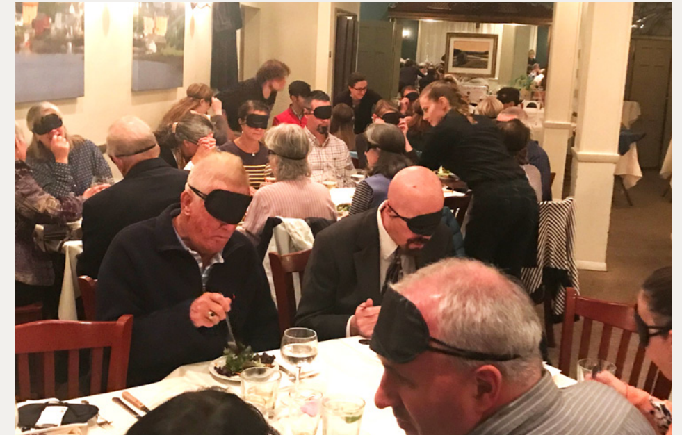
Dinner in the Dark, Rudi's in Portsmouth.