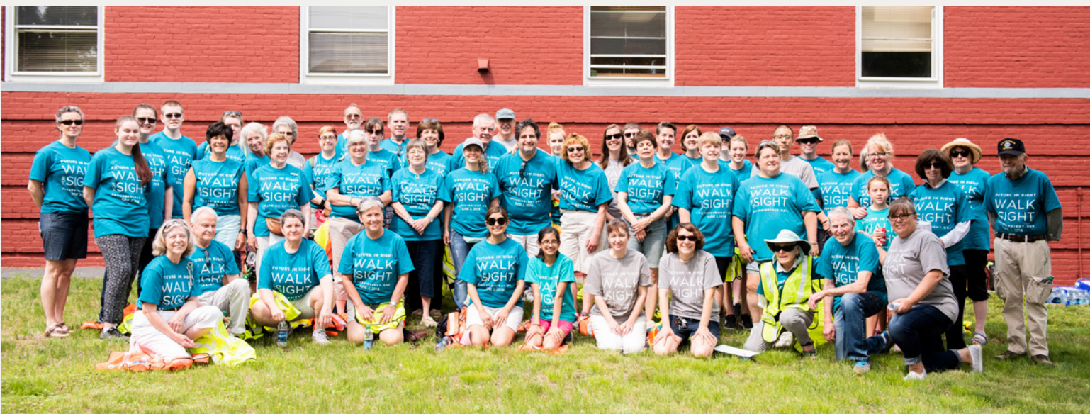
Future In Sight 2018 Walk for Sight volunteers.