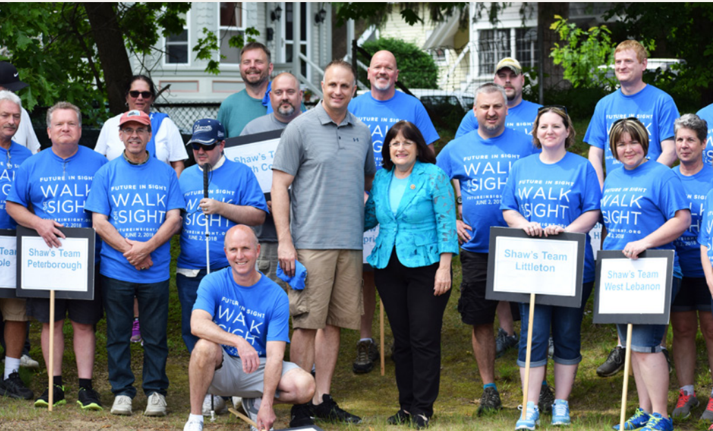
Congresswoman Annie Kuster with Shaw's store directors and their teams.